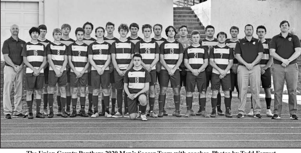
The Union County Panthers 2020 Men's Soccer Team with coaches.